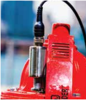
Step 2: Mount two sensors outside of a selected pipe on air valves, fire hydrant or other existing appurtenances.