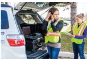
Step 4: Verify radio communication on the receiver.