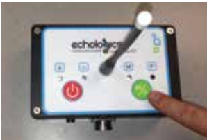
Step 3: Select pipe material on transmitters.