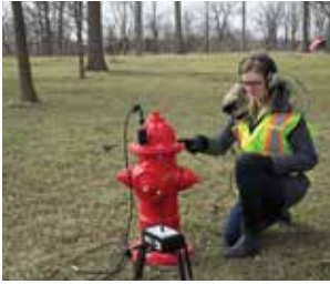
Step 1: Verify units are functional.